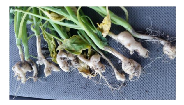
Figure 1. The first case of a clubroot infection found in Ontario canola in 2016

In the summer of 2016, clubroot disease was found throughout a field of canola in West Nipissing. Clubroot has been established in Brassica vegetable crops in Ontario for a number of years, but this was the first time the disease was confirmed in Ontario canola. A soil survey was conducted in 2016 and 2017 across the canola growing regions of the province, and clubbed roots were collected from infested canola fields. The purpose of this preliminary survey was to determine the current distribution of clubroot across canola growing regions of Ontario and to determine the pathotype (strain) present in each clubroot-positive field.